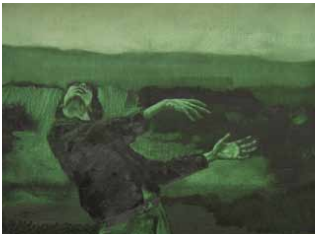
Winner 2011 "Untitled (02-14" Evan Woodruffe