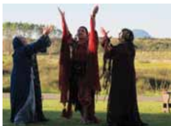
A scene from Macbeth 2011

Rotorua's Shakespeare Outdoors presents: "The Taming of the Shrew"