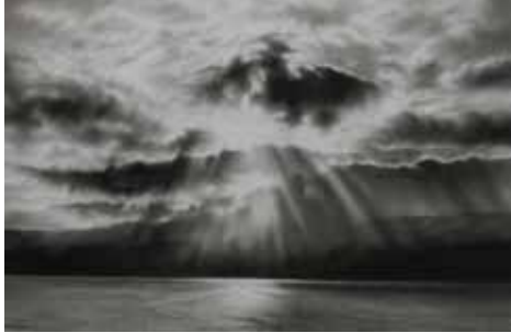
Mehrdad Tahan "Through the Night"